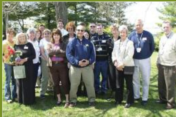
Some of Brighton Hospital's volunteers

Volunteer schedules are flexible and you can commit to as little as one day per month. For more information on volunteering, contact Nate Sjogren, volunteer coordinator, at 810-225-2527, or go to volunteer@brightonhospital.org to schedule an interview and campus tour.