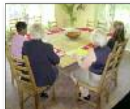
Dining Room provides a comfortable area for meals.